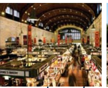
West Side Market